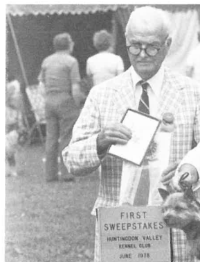
BEST IN SWEEPSTAKE JUDGE WEAR