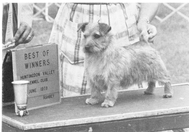
BEST OF WINNERS – KING'S PREVENTION AHOY