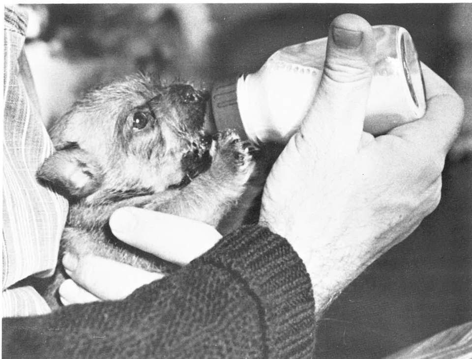
BOB CONGDON WITH FLEDGLING (see story on page 4)