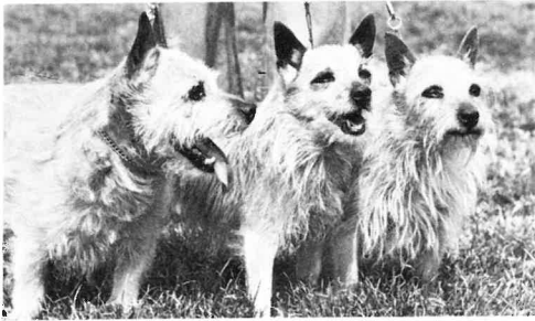
FOURTEENTH BIRTHDAY CELEBRATION. Ch. King's Prevention Barnaby and his sisters, Becky and Amber.