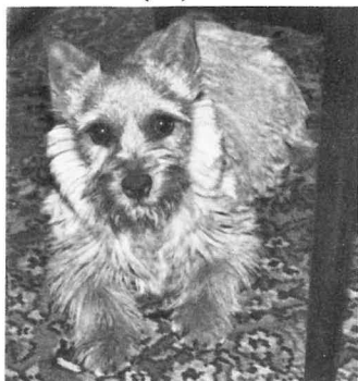
HILLARY'S PLUM RATTLE

ing the puppy would feel at home and be well cared for immediately—and at minimum expense.