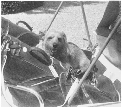
JOLLY GOOD LOVE