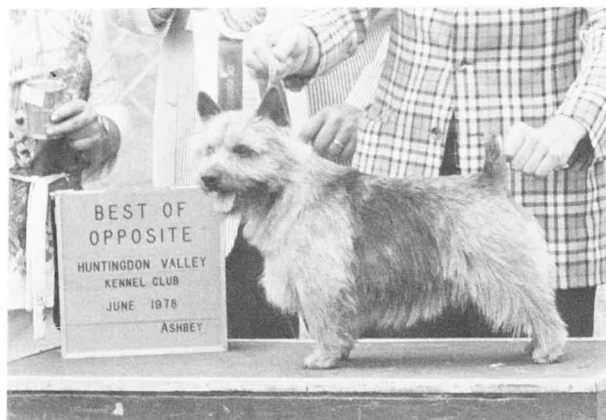
BEST OF OPPOSITE SEX - CH. WINDYHILL CLOWN