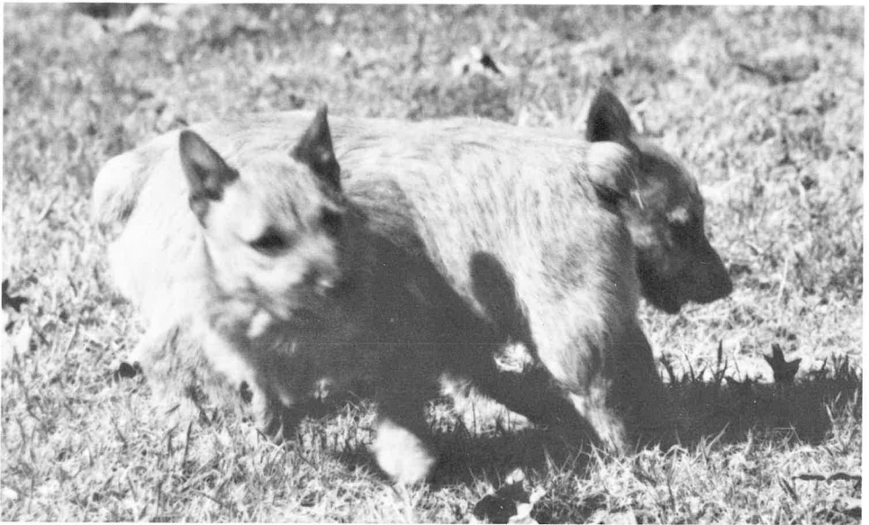
RED OAK PUZZLE. Can you find Red Oak Dauntless and Red Oak Trilby in this photograph? Can you sort them out?