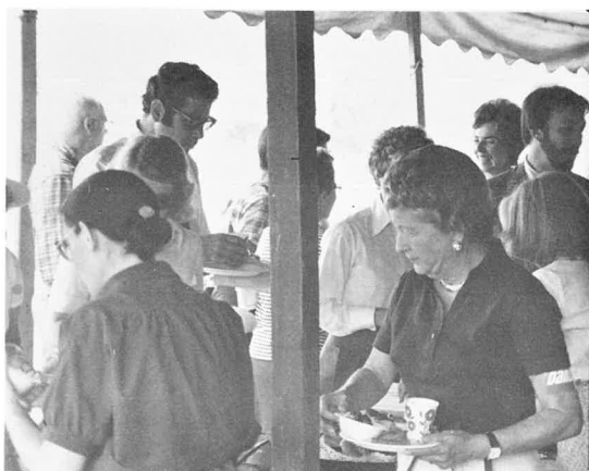
AS THE ARMBANDS COMMENTED, LUNCH WAS "DANDY".