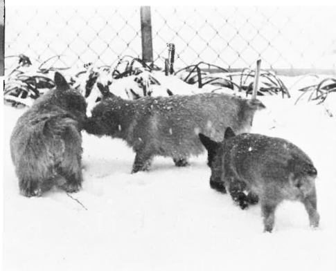
DOGS IN SNOW: In Louisiana, Charles Forrest's first homebred litter investigate their first snowfall, a surprise on January 18. They are by Am. Can. Ch. Culswood Capers x Nutmeg's Poppy Seed.