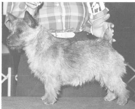
CH. PICCADILLY PENNY FARTHING (Ch. Todwil's Speed Trap x Ch. Piccadilly Sugar N' Spice)

Molly finished her championship at 10 months from the Bred-by-Exhibitor class, with three majors to her credit. Always owner/handled, Molly is a joy to show and love.