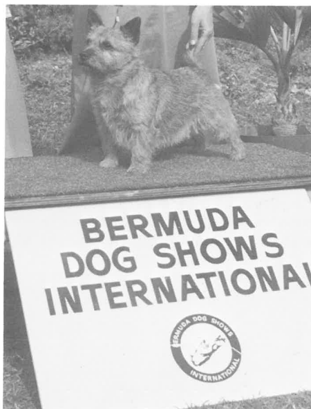
Am/Ber Ch King's Prevention Devondale