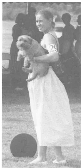
Norfolk Group Two