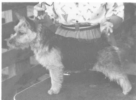
CH. PICCADILLY GOLLY MISS MOLLY (Ch. Todwil's Macho Man x Todwil's Piccadilly Pippin)