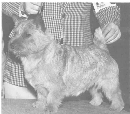
CH. LONG VALLEY WEAVER HOMESPUN (Ch. Thrumpton's Lord Mothkin x Ch. Royal Rock Pebble)

Penny is a second generation, homebred champion. Always owner/handled, Penny tied for #8 Norwich Bitch in the last half of 1986 under the Knight System.