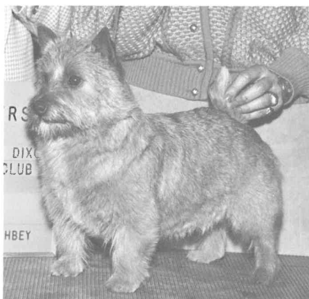
CH. ROLLING RIDGE'S TUFF E. NUFF (Ch. Redash Tarquin x Ch. Rolling Ridge's Prima Donna)